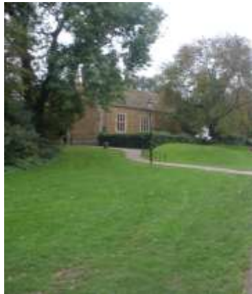
Via All Saints Passage

Vehicular access is not generally permitted within the park. However, if necessary for maintenance purposes, vehicles only traverse footpaths which are approved for vehicular use. When large events are taking place in the park, vehicle access is gained from the north eastern corner at the junction of Burley Road and Station Road.