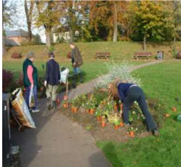
Floral displays are limited due to the area's designation as a Scheduled Monument so Oakham in Bloom has focused on the beds around the bandstand.

Oakham Town Council employs a contractor for its grounds maintenance and the standard has improved steadily over the years. Please see Appendix 1 for the current Grounds Maintenance Schedule and Appendix 2 for comments from In Bloom judges relating to Cutts Close.