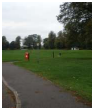
Via Burley Road & Car park