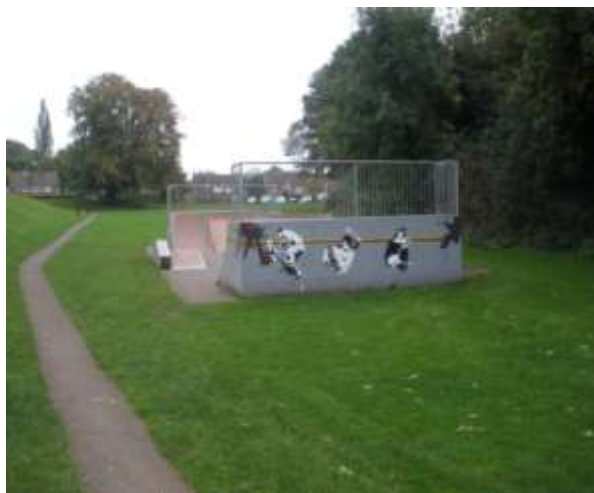
Oakham's skateboard facility

A local graffiti artist was commissioned to paint the facility in 2008.