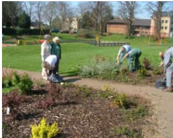
Oakham in Bloom volunteers working on the flower beds around the Bandstand

Oakham In Bloom was formed in August 1997 - the committee consists of volunteers drawn from the community and works in partnership with Oakham Town Council, Rutland County Council, schools and youth groups, voluntary organisations, residents and businesses. The committee and their gardening and fundraising volunteers strive to: improve the environment for people who visit, work and live in the town; reduce graffiti, vandalism and litter; encourage the community to plant and care for flowers, trees and shrubs.