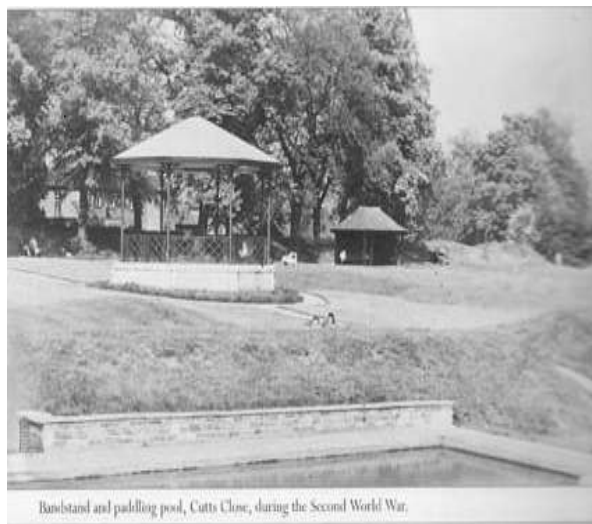
Cutts Close looking north, showing the original bandstand and shelter. The wall in the foreground was later included in the enclosed toddlers' play area