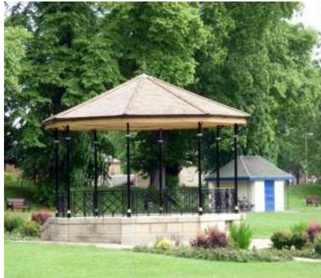
Newly refurbished bandstand May 2010

The Bandstand hosts band concerts and other events throughout the summer.