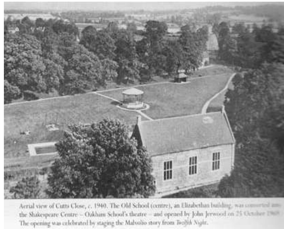
Cutts Close looking north east, with the original Old School in the foreground and the bandstand at its centre. Oakham Castle's site is out of the frame beyond the bottom right of the picture

The site was registered with the Land Registry in 2005 as Title Number LT375494