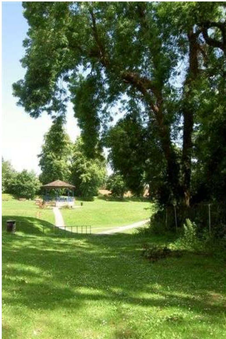
View of Cutts Close from Church Passage looking north

The Town Council believes this Management Plan will ensure the park continues to provide an important informal recreational space for residents and visitors and safe enjoyment for all those who use it.