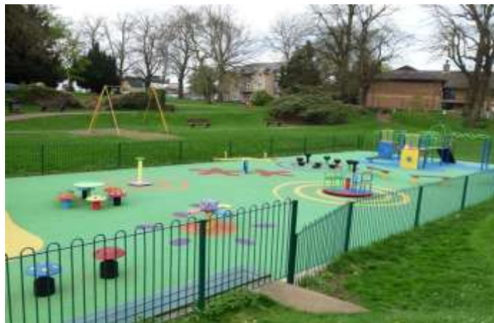
Toddlers' play area