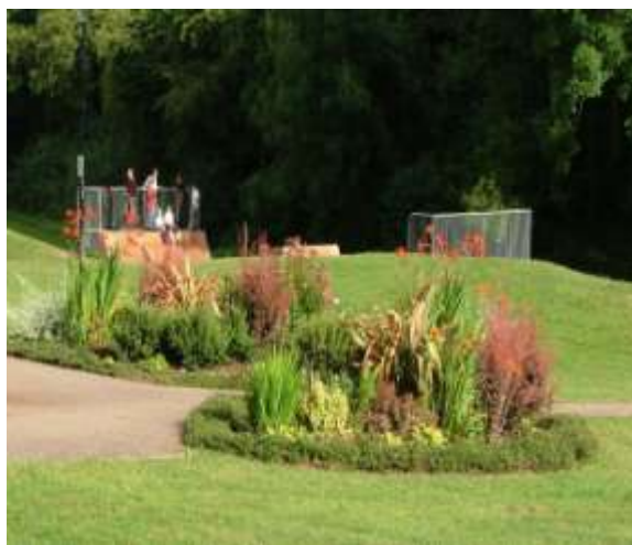
View of skatepark from the Bandstand

The skatepark is inspected regularly for any defects and the Town Council allocates an annual sum towards its maintenance. The Council, in collaboration with the police and users of the facility, will be installing a floodlight to enable the facility to be used during the winter months.