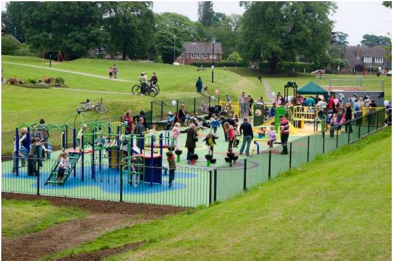
Opening of new Toddlers' Play Area in May 2008