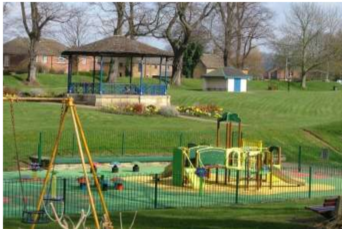
View of toddlers' play area looking north towards bandstand (prior to its refurbishment)

There is one main play area at the southwest side of the park. The toddlers' play equipment was installed in 2008 and replaced an existing facility that had become increasingly in need of updating. The site is a former paddling pool and incorporates fencing and safety surfacing and a wide range of equipment for those up to seven years of age. There is seating within the area and two self closing gates ensure maximum safety for young children playing in the area. There are various swings surrounding this area and in August 2010 Oakham Town Council was given permission by English Heritage to install some additional pieces of equipment for 8-13 year olds.